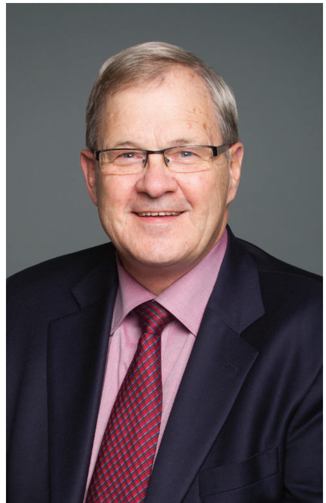
The Honourable Lawrence MacAulay, Minister of Agriculture and Agri-Food.

I hope everyone has a chance to sample some of the delicious all-Canadian poultry and egg products at Downtown Diner 2024, taking place on Sparks Street in Ottawa—brought to you by our hardworking farm families. As Canada's Minister of Agriculture and Agri-Food, I am working hard on all fronts to ensure a strong future for everyone working in our agriculture sector, and I'm so pleased to work with our supply-managed industries to make sure we have a strong and stable food supply for Canadians for years to come.