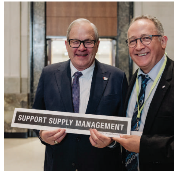
Chicken Farmers of Canada Annual Lobby Day Reception: Minister of Agriculture and Agri-Food Lawrence MacAulay and Member of Parliament Yves Perron.